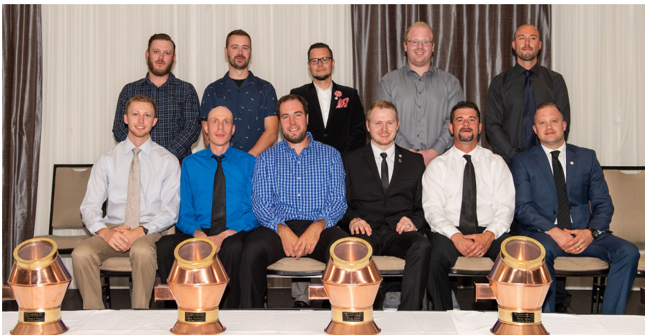
Saturday night at the Delta Ocean Pointe Resort and Spa.