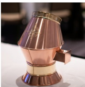
A binnacle – a housing for a compass that is installed on a ship's bridge