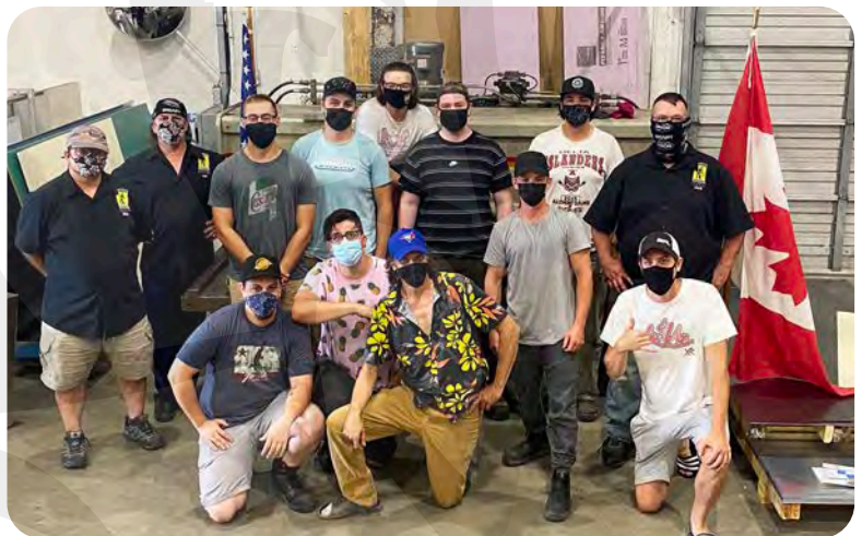
Architectural Sheet Metal Level 3 class