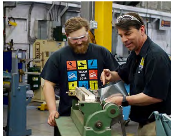
Sheet Metal Workers Training Centre Society

The website features online tools to assess skills and a learning portal, as well as connect directly with training schools and campuses across the province.