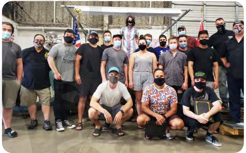
Sheet Metal Level 4 class

The graduating students certainly stepped up to the plate with excellent results! Per Jud Martell, Training Coordinator, "they went 16 for 16 passed the IP (Level 4 - SM) and 10 for 10 passed the CofQ (Level 3 - ASM). 26 for 26!!! This set the new standard (previous was the 24 for 24 IP last summer) of 100% completion rate. Almost a perfect class with all passing the Level 3 and 4, and attendance was perfect for the ASM and only one student missed 3 days in the SM. Amazing!