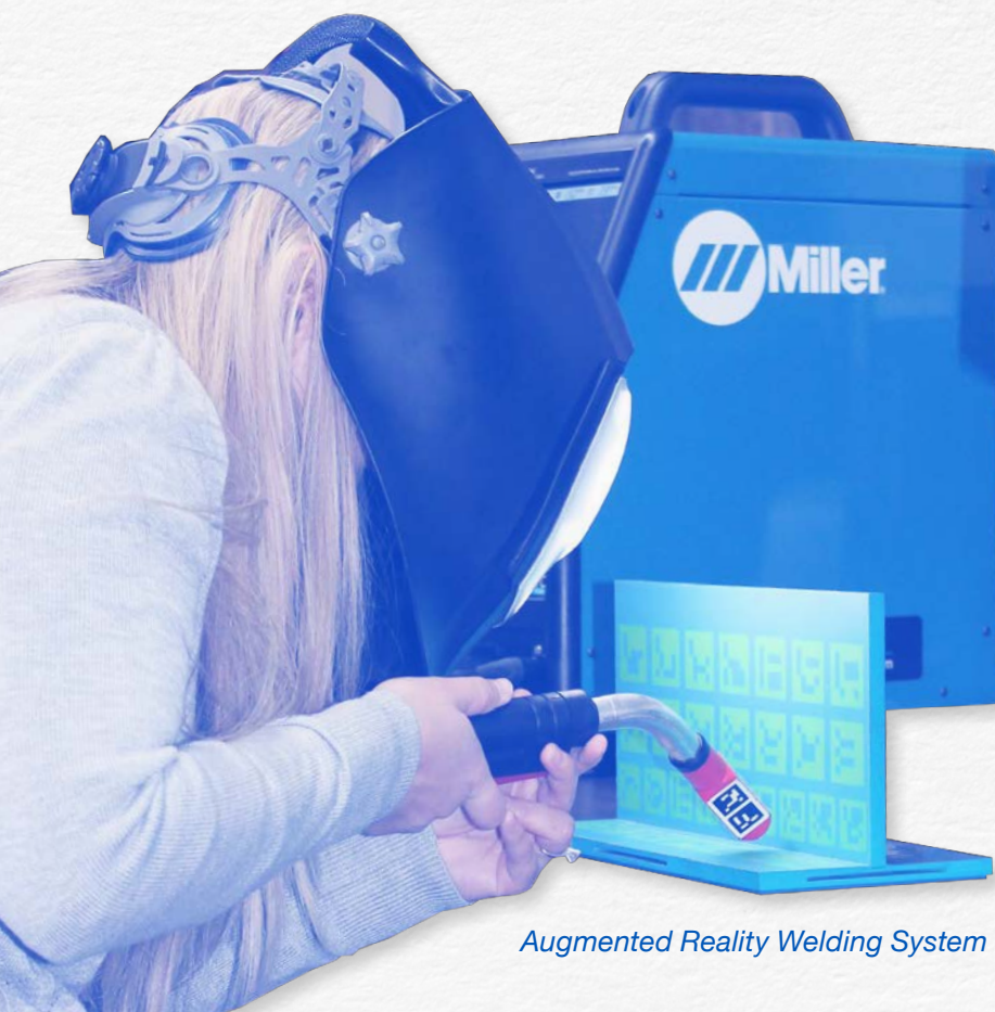
Augmented Reality Welding System

Between March 2019 – March 2024, 257 students journeyed, successfully completing their apprenticeship