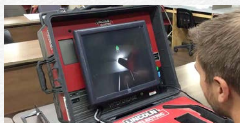
Virtual Reality Welder VRTEX® Engage