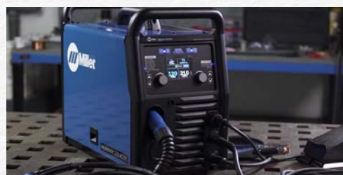
Multimatic® 220 AC/DC Welding Machine